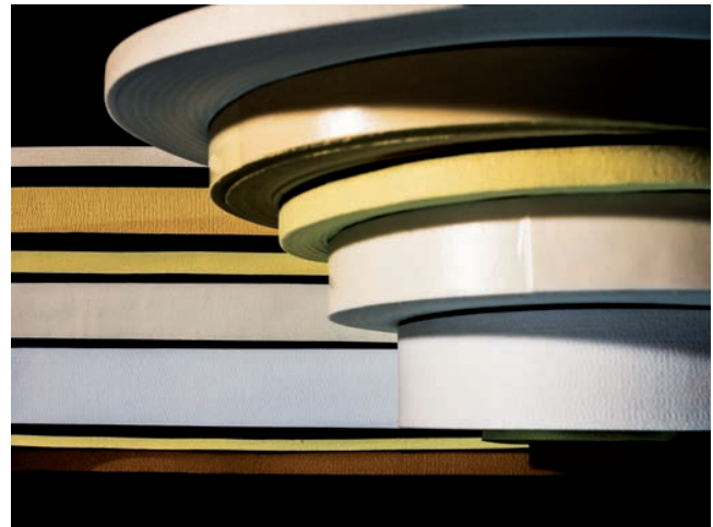
Endless strips in variable width

BWF Tec GmbH & Co. KG Wilhelm-Maybach-Straße 5 95028 Hof-Gattendorf Germany T +49 9281 85008-0 info@bwf-protec.com